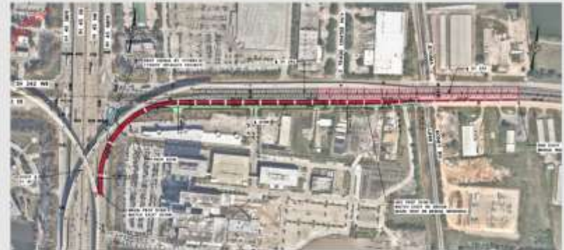
I-45 from Shenandoah Dr to SH 242 (0110-04-202 & 0110-04-205)