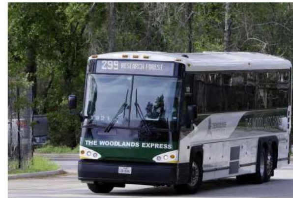
1 of 2