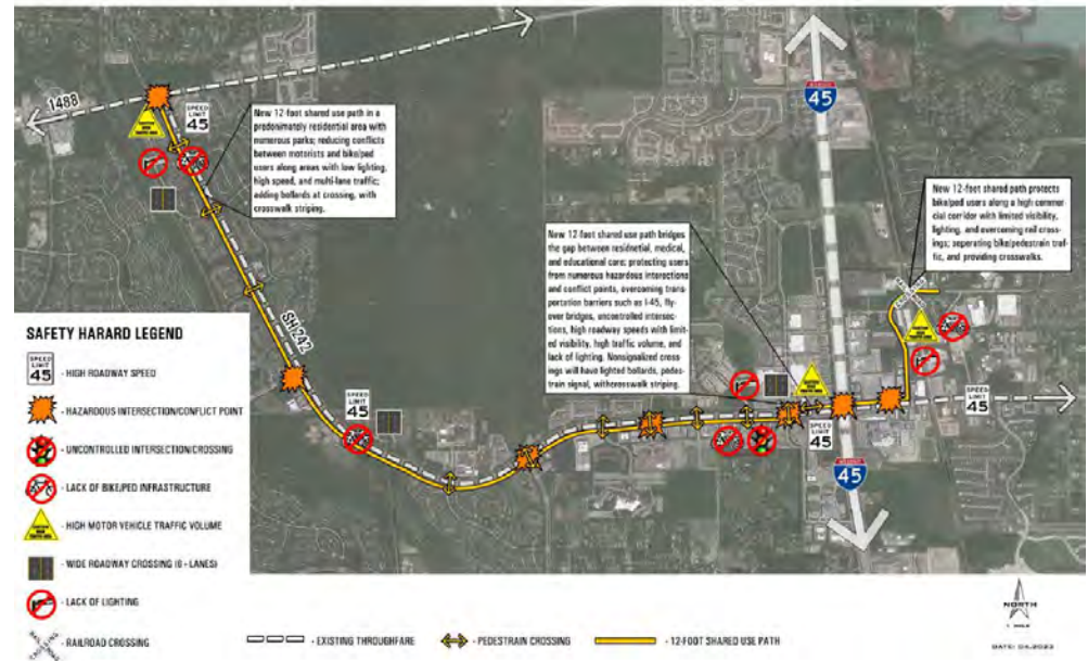
SH 242: COLLEGE PARK SAFETY ISSUES