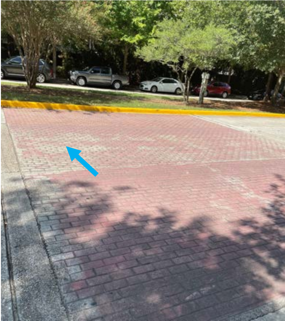
Location 6: Timberloch Dr.